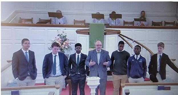
--Mission & Service Committee