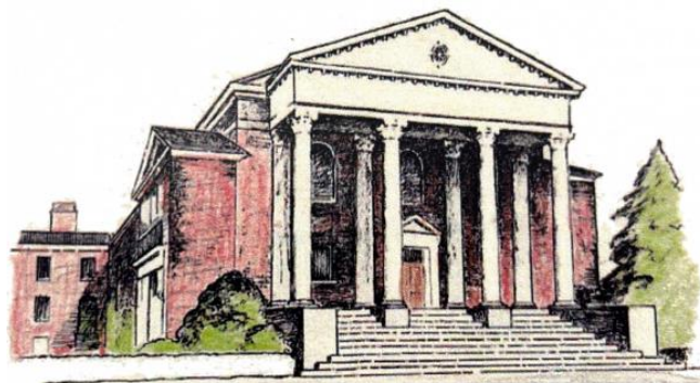
First Presbyterian Church